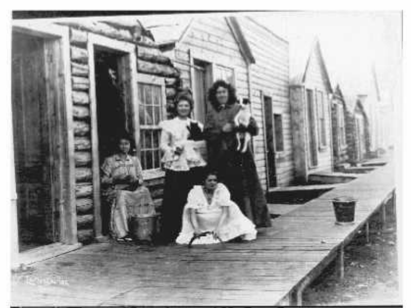
Figure 2: Women of Lousetown outside the cribs.

The Dawson police realized it would be foolish to try to suppress the sex trade, so they all but legalized it. In the fall of 1899 there was an outbreak of venereal disease. In response, they