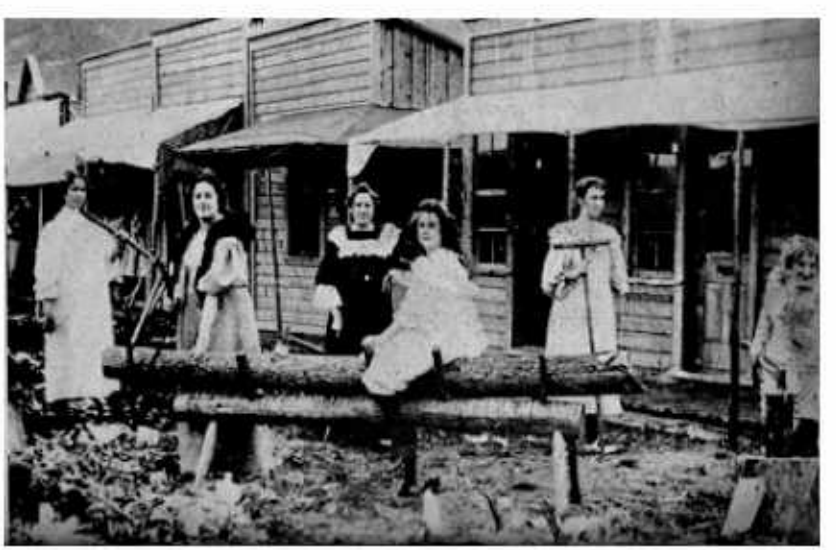
Figure 4: Dawson City Prostitutes

While outwardly, women of rank avoided contact with women of the red-light district, inwardly, the younger women were secretly intrigued by the unethical lifestyle of the harlots. Berton writes in her memoir of quickly ducking out of a dress shop when two girls from Lousetown entered. Berton and her friend were afraid to be seen shopping in the same