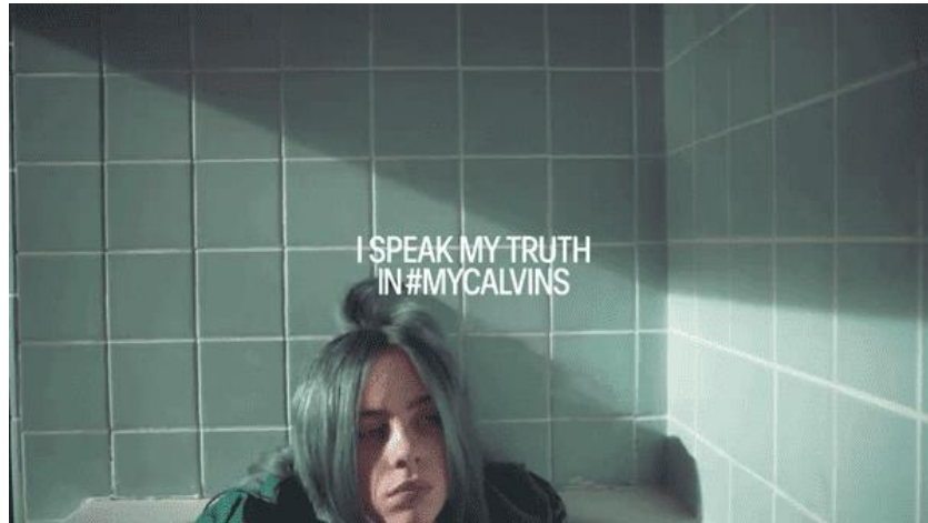
Fig. 10 An image taken from the Calvin Klein advertisement

jumpsuit. It first cuts to her staring intensely into the camera and then to her kissing the mirror. She is then shown lying in a bathtub in her green jumpsuit laughing as she plays with a ring she has picked up from in front of the mirror. The ad finally ends with the slogan “I Speak My Truth In #MyCalvins” plastered above her head in capital letters as she slouches in the tub (Fig. 10).