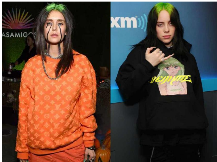
Fig. 4 Actress Nina Dobrev (left) dressed up as Billie Eilish (right) for Halloween in 2019

Therefore, an analysis of Billie Eilish holds several different stakes, which relate to my original question about the state of a generation, and also reveal important points of exploration for broader issues. This analysis of how Eilish navigates the active process of embodiment will thus underscore how body projects are deeply tied to gender, consumption, and matters of agency and identity.