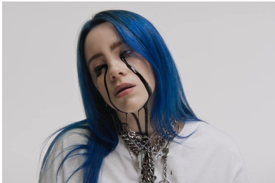
Fig. 1. An image from Billie Eilish’s music video for “when the party’s over” in which Eilish cries black ink

In order to give the reader a sense of her art and insight into how she is portraying herself and her view of the world, I will provide a brief look into the content of her songs and music videos. Many of Eilish’s music videos contain violent imagery and body horror - a bodily manifestation of much of the lyrical content of her songs. Examples of this are her music videos for “bury a friend”, “when the party’s over” (Fig. 1) and “all the good girls go to hell”. She described the song “bury a friend” in a press release as being “from the perspective of the monster under my bed. If you put yourself in that mindset, what is this creature doing or feeling? I also confess that I’m this monster, because I’m my own worst enemy. I might be the monster under your bed too” (Eilish, 2019).