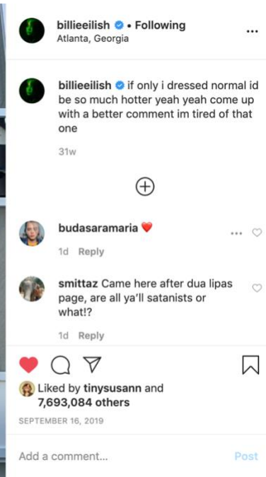
Fig. 5-7 A selection of photos from Billie Eilish’s Instagram. The bottom caption reads: “if i only dressed normal I’d be so much hotter yeah yeah come up with a better comment im tired of that one”