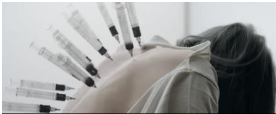
Fig. 2 An image from Eilish's music video for "bury a friend"

white hospital nightgown in a sterile white room with fluorescent lighting (Fig. 2). These images repeat themselves until the end of the music video, where she levitates upside down in the hallway of the building. The gloved hands continue to pull Eilish's hair and smother her face in a violently erotic fashion, one of the hands opens her mouth and strokes her lips. The video ends with Eilish back under the bed below the man who is now sleeping soundly, the song ends and the beginning of the song "ilomilo" (which features the aforementioned line about burying friends in reference to suicide) begins to play before the video goes black