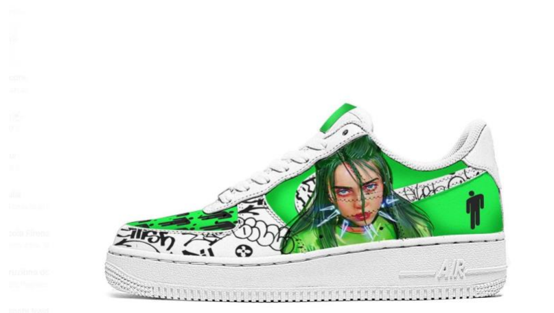
Fig. 12 A custom designed Nike sneaker created by an Etsy user selling for $271

One such element of Eilish's bodily presentation is her sneakers. Eilish has professed her love for sneakers - she has appeared on several sneaker-fanatic blogs, and there are custom sneaker designs dedicated to the singer on Etsy and similar websites (Fig. 12). The singer also appeared on a sneaker shopping segment with Complex which Wikipedia defines as "an American New York-based media platform for youth culture [which] reports on trends in style, pop culture, music, sports and sneakers with a focus on streetwear, sneaker culture, hip hop, and graphic art." In the segment, Eilish stated that she is potentially collaborating with Air Jordan sneaker brand on a shoe for the women's line, as she expressed discontent with the women's sneakers that are available and claims to only wear men's sneakers. Sneakers here can again be seen as a testament to Billie Eilish's desire for comfort in female dress. We can contrast her donning of the shoes to high heels, which often decrease the wearers' mobility and comfort.