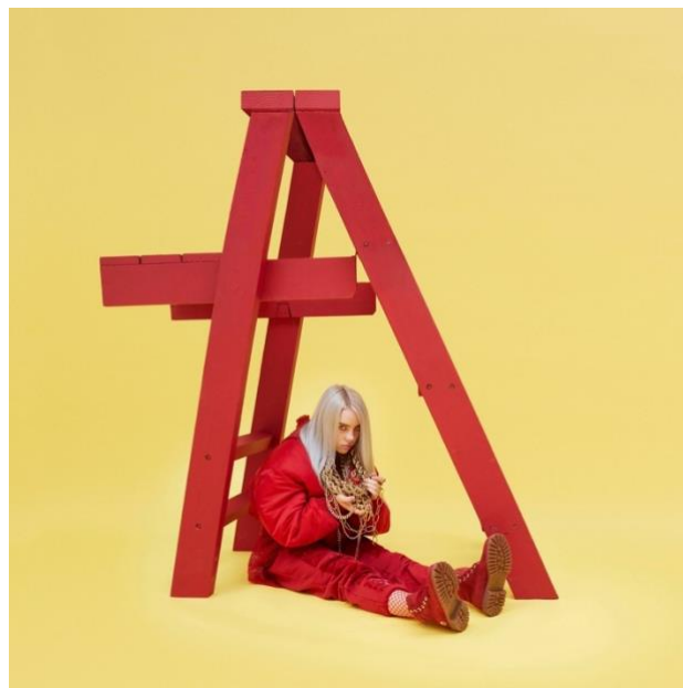
Fig. 8 Album cover for Billie Eilish's debut album Don't Smile at Me

One major benefit of my analysis was that I was able to gain a lot of information about what media and fans are saying about Eilish via the internet. I also had access to interviews as they are freely available on the internet. Additionally, social media is a source for understanding Eilish's interactions with her audience. These sources are very helpful for understanding the big picture of who Eilish is, and the public conversation that exists between the media, Eilish and her fans which provided ample content for my analysis. However, one cannot take the things that Billie Eilish says during interviews at face value and another level of analysis must take place to speculate on the factors that contribute to, and the consequences of, her public words. Additionally, content on the internet often doesn't allow for in depth understanding of her fan's perspectives as it is often limited to social media posts and brief interviews for news outlets. Being able to directly interview some young fans of Eilish about some of my questions would have been a valuable addition to this thesis.