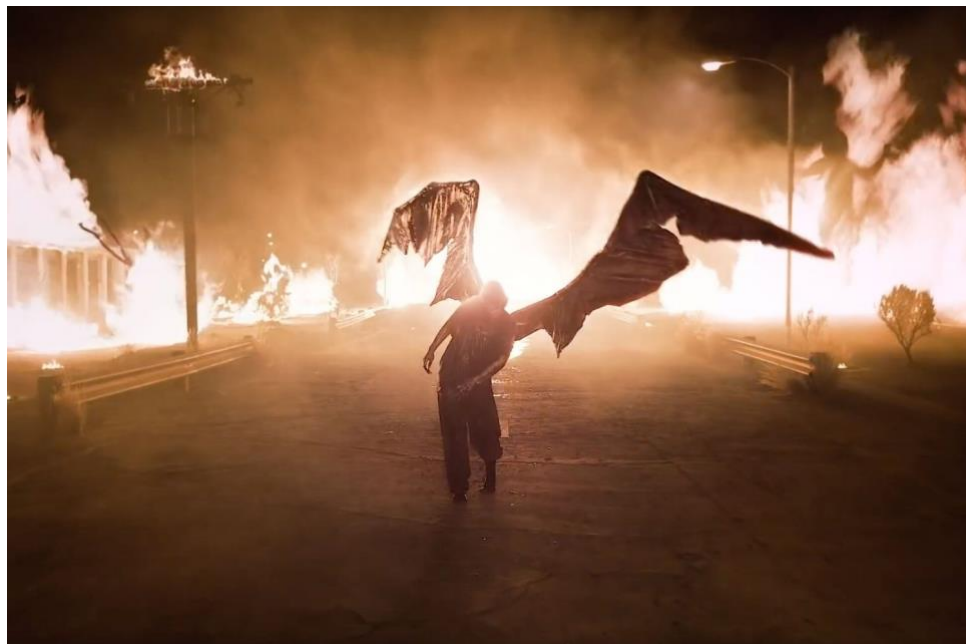
Fig. 3 An image from Eilish’s music video for “all the good girls go to hell”